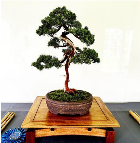
First Place was a Shimpaku – Juniper chinensis shimpaku 85 years old, in training with Erich B. for 5 years.

You are becoming more confident/comfortable in performing these skills, but you still are learning and refining these skills.