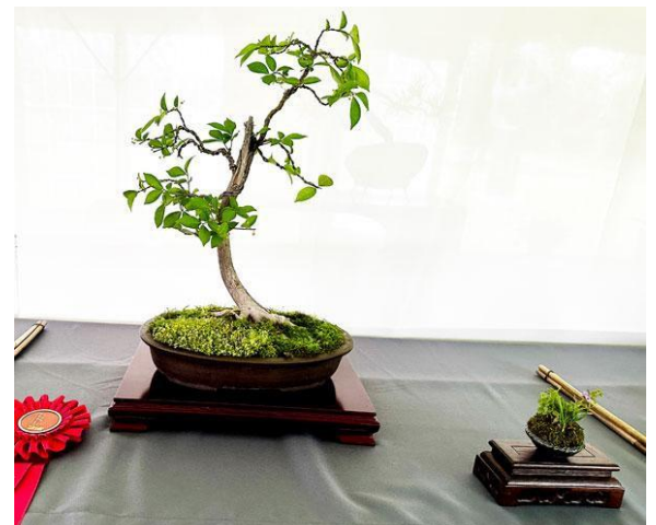
Second Place was a Burning bush, Euonymus alatus 15 years old in training with Valerie S. for 4 years.