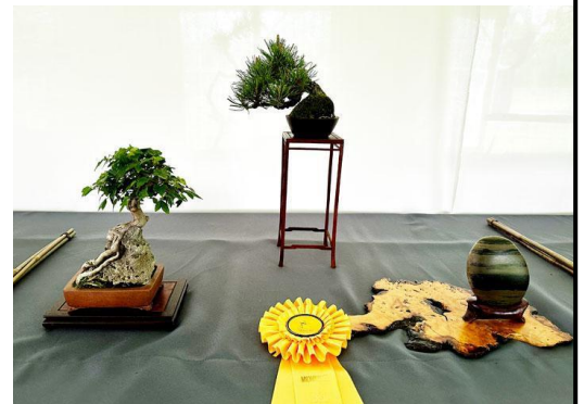
Third Place was a Trident maple and red pine - Acer buergerianum and Akamatsu each about 10 years old, in training with Greg B for 4 years.