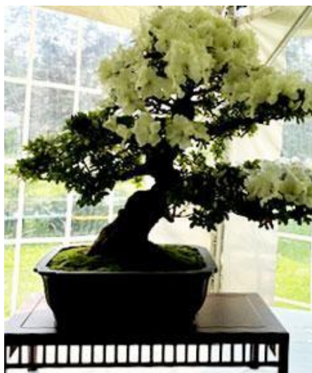
Peoples' Choice was a very large white flowering Satsuki azalea- Rhododendron Indicum "Gyoten"

Each MBS member should reflect on the skill categories and self-determine at which level of proficiency their skills are at. The following pages describes these levels and have more pictures of the Annual Exhibit winning trees.