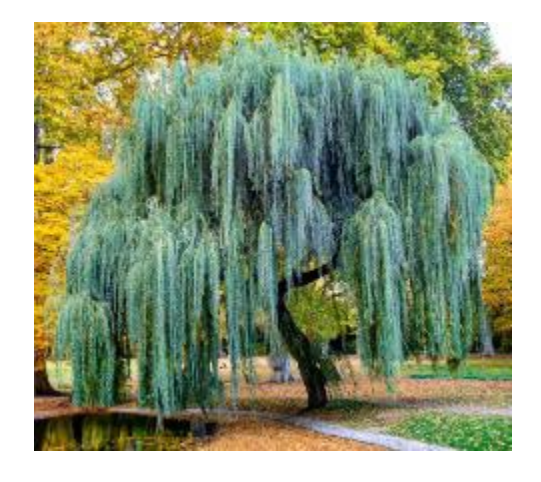
Weeping willow's tears Blown away on autumn leaves Days before the snow

~Reflections of Life Modern Haiku of Vaugh Banting