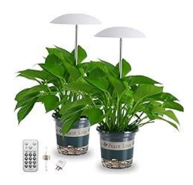
Cool looking Grow lights