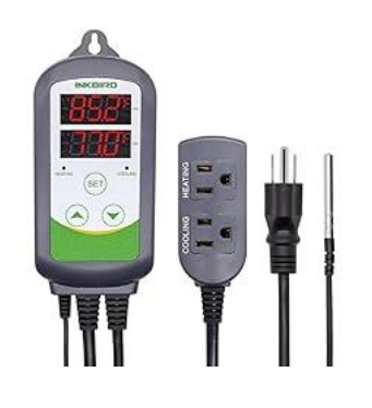
Inkbird Digital Temperature Controller