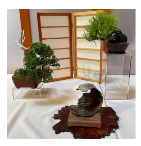
Greg Black, Open category, Japanese red pine