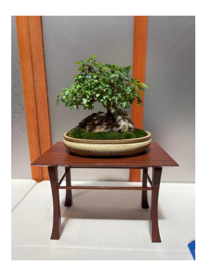
Ron Fortman, Open category, 1st Place, Trident maple root over rock