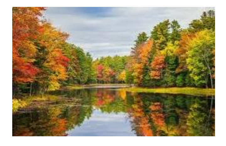
Fall is upon us, Splashing color all around; Cool and refreshing