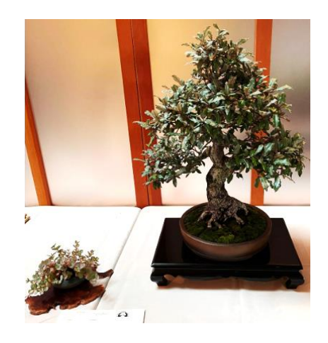
Judy Schmidt, Novice category, Japanese silverberry

MBS was well represented with four of our members entering trees and/or kusamono displays. They took home 4 ribbons, 2 first place, 1 Award of merit, and 1 second place.