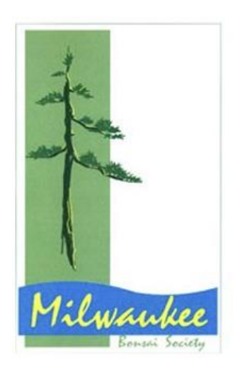
PO Box 240822 Milwaukee, WI 53224 www.milwaukeebonsai.org

Next MBS meeting will be September 7, 2024 @ 9am