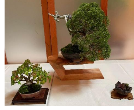
Greg Black, Open category, Shimpaku Juniper