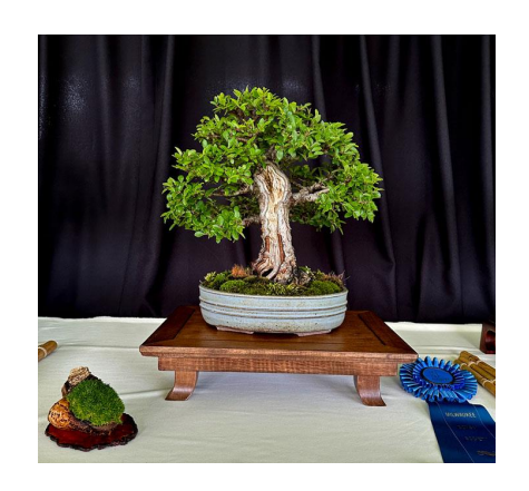
Peoples' Choice was the 1<sup>st</sup> place Open winner a Cork Bark Elm - Ulmus parvifolia 'Corticosa by Kris Z .

has more pictures of the Annual Exhibit winning trees.