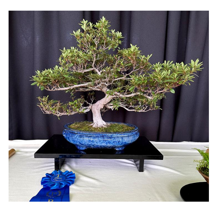
First Place was a Satsuki azalea "Hinomaru" - Rhododendron indicum 30 years old in training with Rick W for 5 years. The container is a Shuho from Japan