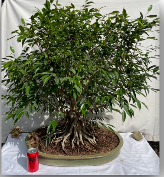
*Ficus microcarpa *Approx 35 years old Approx 30" high and 36" wide Pot approx 25"w, 18"d, 3.25" h