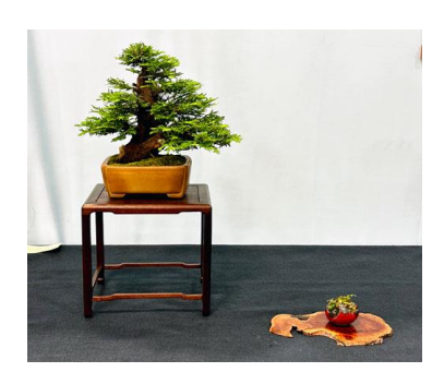
Steves coastal redwood