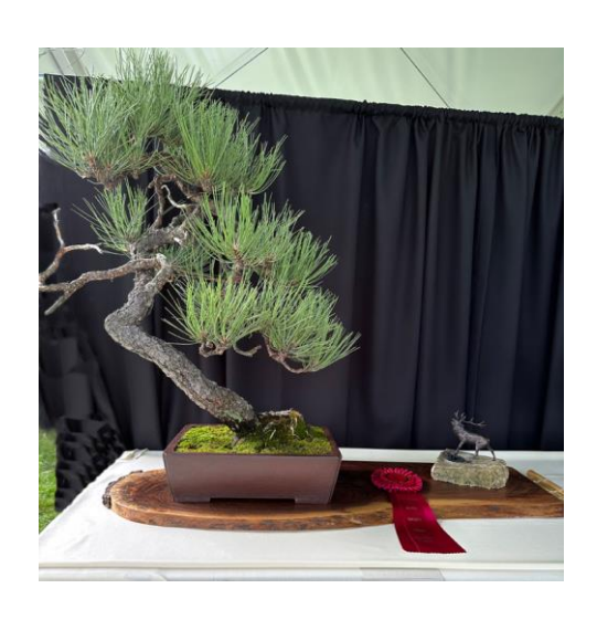
Second Place was a Ponderosa Pine- Pinus ponderosa 129 years old in training with Scott D . for 4 years. The container is a Yamaaki (Tokoname) and slab is walnut.