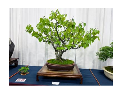
Pam's white birch