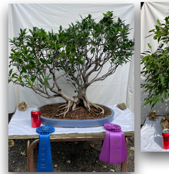
*Golden Gate Ficus *Approx 30 years old Approx 30" high and 34" wide Pot approx 25"w, 16"d, 2.5" h