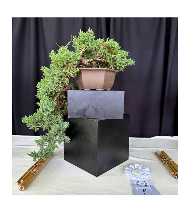
Third Place was a Common Juniper - Juniperus procumbens 'Nana' about 8 years old and in training with Rob S . for 2.5 years.