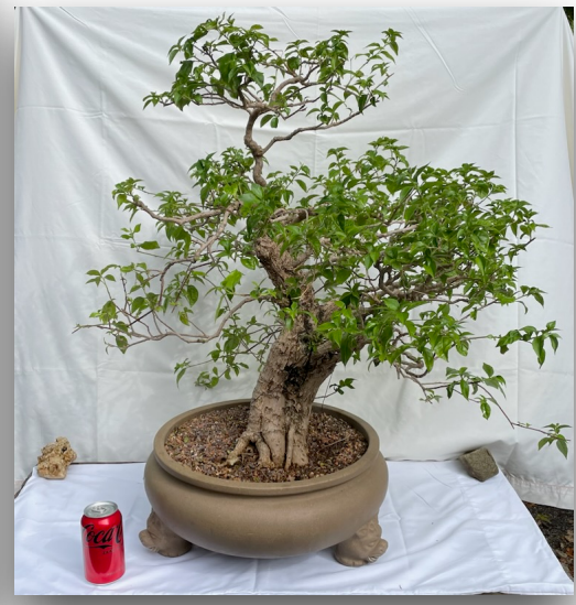
Bougainvillea *Approx 40 years old Approx 30" high and 32" wide Pot approx 14" diameter, 7.5" h