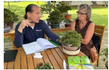
Discussing Azaleas at the AE 2022