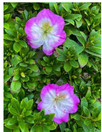
Satsuki Azalea Blooms