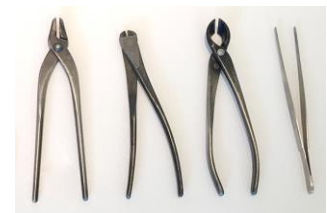
Basic Set of Tools.

https://www.amazon.com/dp/B00W1Y6JVK?th=1