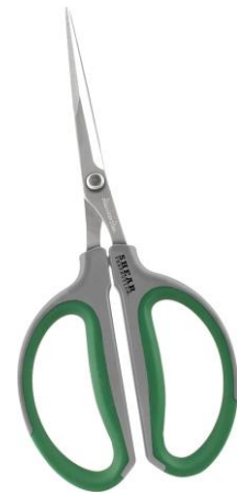
Steel Bonsai Shears on Amazon

Wire cutters with a blunt end that can cut heavier gauge wire and not hurt the bark when removing wire from a branch. You're probably wondering "Why can't I use pliers and wire cutters I already have in my toolbox?" Initially you might be able to, as long as the wire you're using is small wire. But bigger trees require heavier gauge (thicker) wire to hold a branch you want to bend.