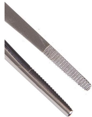
Look for deep serrations for good gripping in both pliers and tweezers.