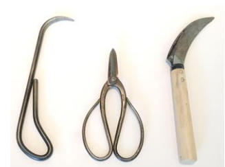
Tools for Repotting.