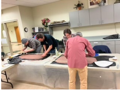
A few pictures from the Oval Pot Making Class: