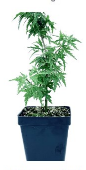
Kotohime Japanese Maple

Kaede Bonsai-en 3307 Ferry Landing Road Dunkirk MD 20754 United States