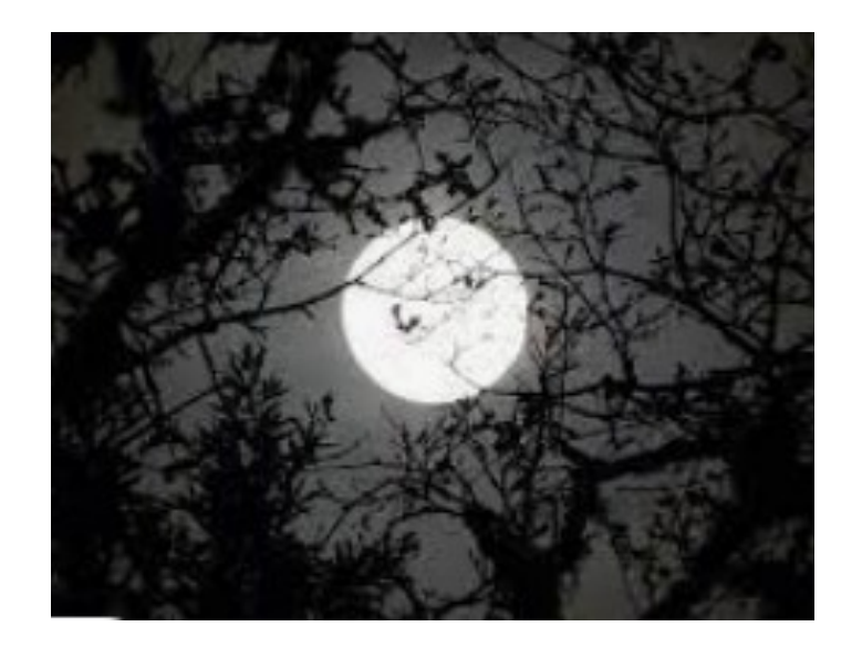
Twisted shadows creep Into yards and fertile minds... Autumn moon on trees