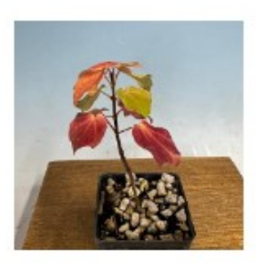
Miyasama Trident Maple