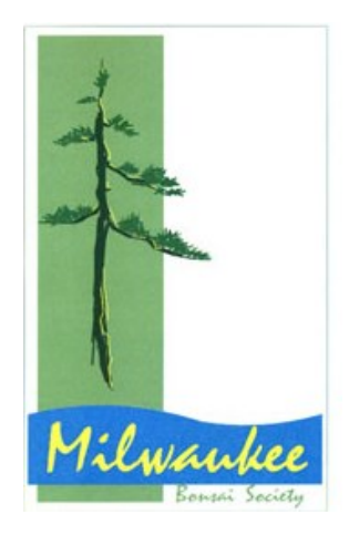
PO Box 240822 Milwaukee, WI 53224 www.milwaukeebonsai.org

Next MBS meeting will be November 5, 2022 @ 9am Boerner Botanical Gardens