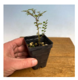
Seiju Cork Bark Chinese