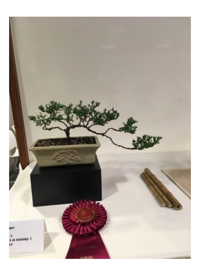
2nd Place - Juniper - Erich B