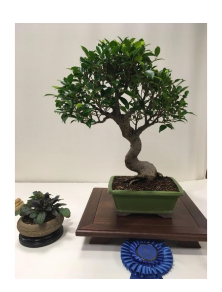
1st Place - Tiger Bark Ficus - Rena P