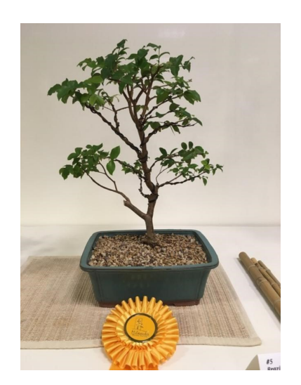
3rd Place - Brazilian Grape—Erich B