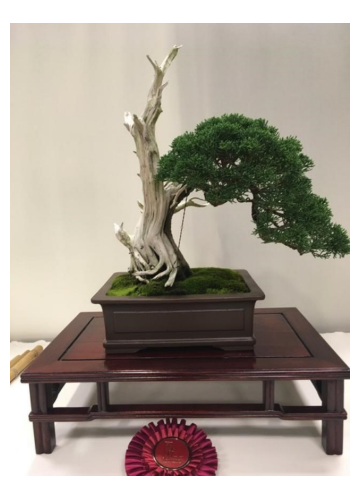
2nd place — Shimpaku Juniper - Jack D