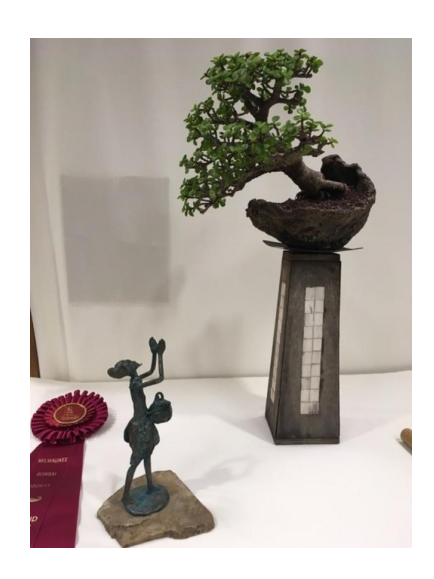
2nd Place - Spekboom - Kevin S