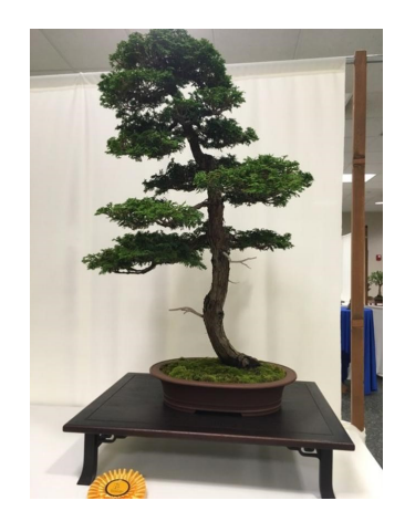
3rd place — Hinoki Cypress - Rocío S