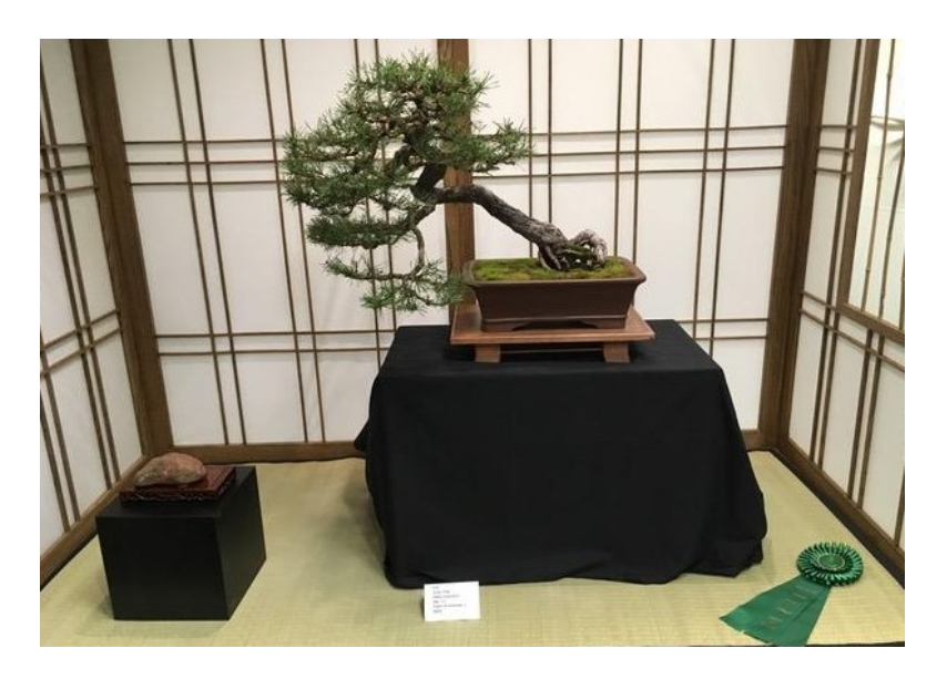
Scots Pine—O- Pam W