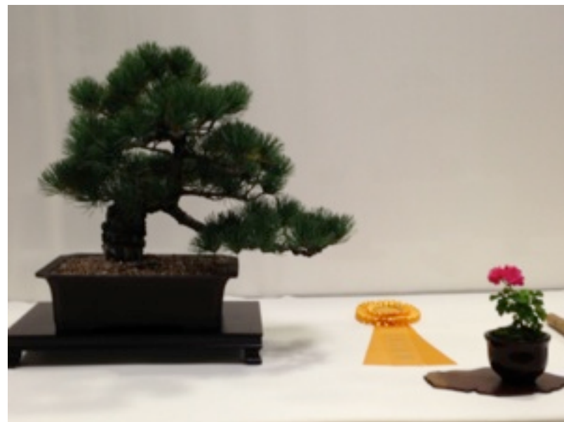
3rd Place Japanese White Pine Joe V