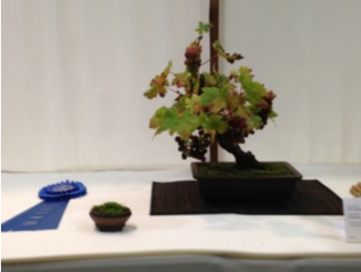
1st Place Grape Rocio S