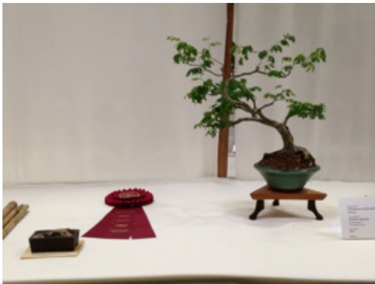
2nd Place Brazilian Raintree Liza W