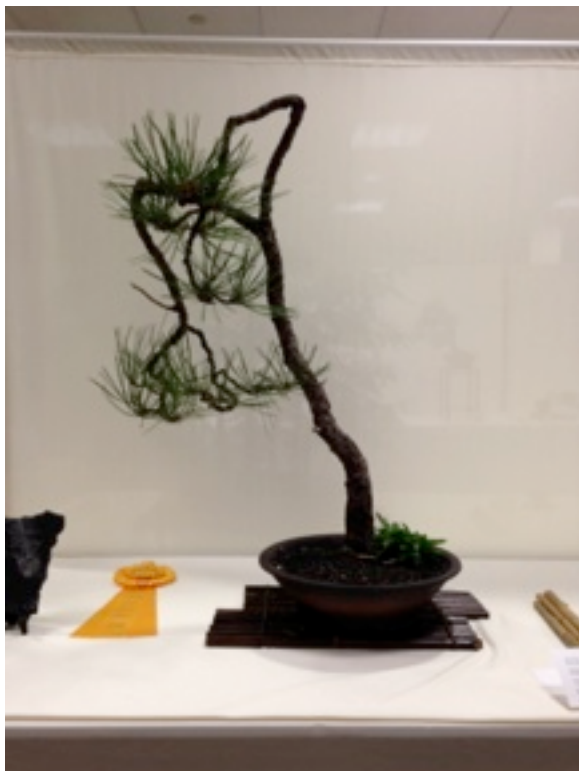
3rd Place Ponderosa Pine Teri W