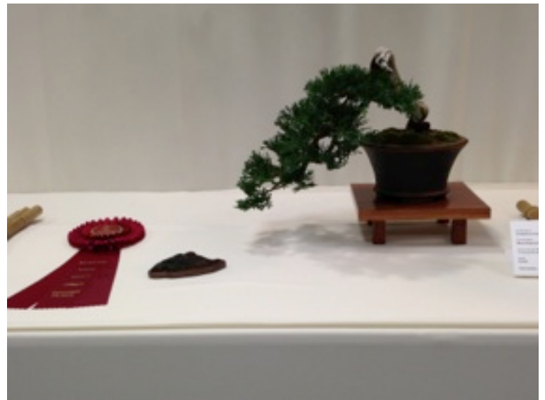
2nd Place Blue Rug Juniper Greg P