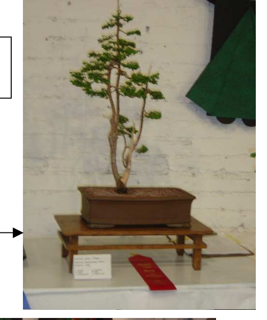
Hinoki Cypress - S. Hurula