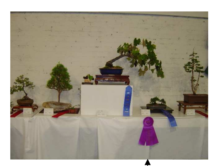
Display from State Fair Show

I'm very sorry, but I lost my paper with who worked at the novice classes. Can you contact me if and how many times you worked? Thanks. Kris