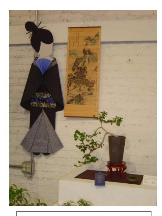
Natal Plum