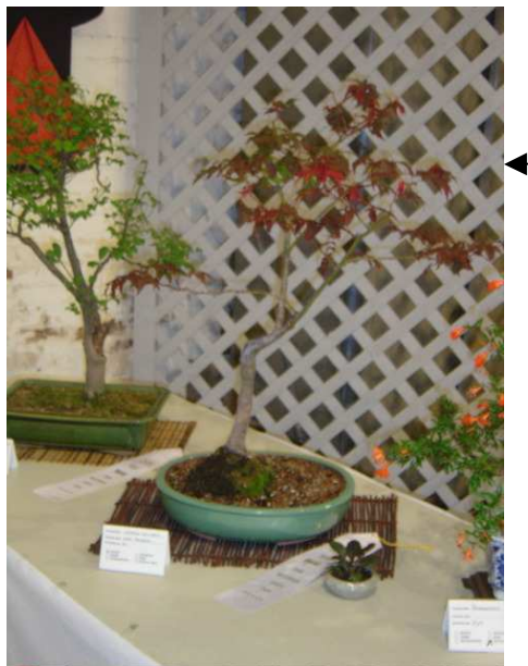
Japanese Mape – B. Goetzke