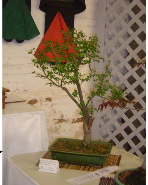
Burning Bush - T. Plicka