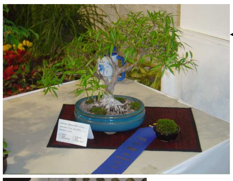
Narrow Leaf Ficus